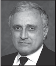
Carl P. Paladino